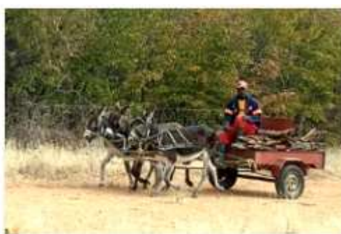
Kalahari Ferrari in the Bushveld