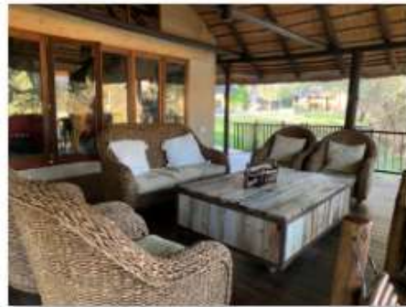
First night's venue