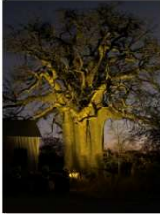
Baobab tree at night

We dine at the venue where we overnight.