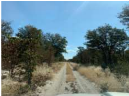
'Lekker' Jeep track