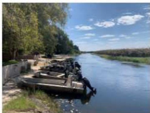
Ready for sunset cruises