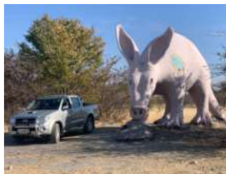
Close to Planet Baobab